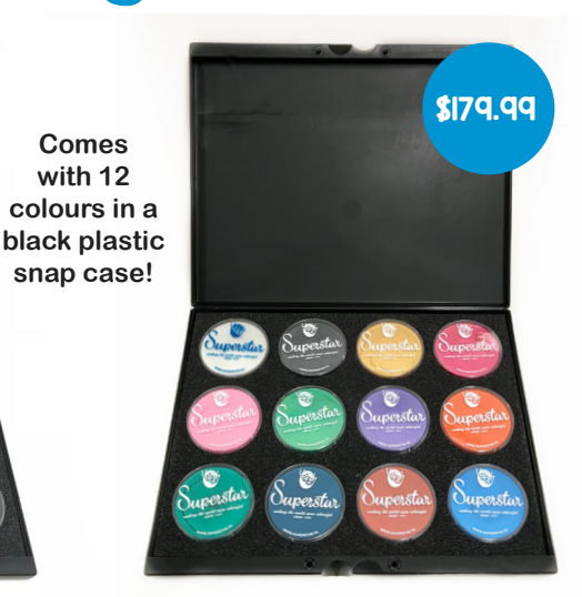
METALLIC PALETTE SET