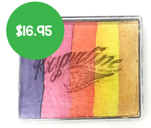
GEM METALLIC - 50g