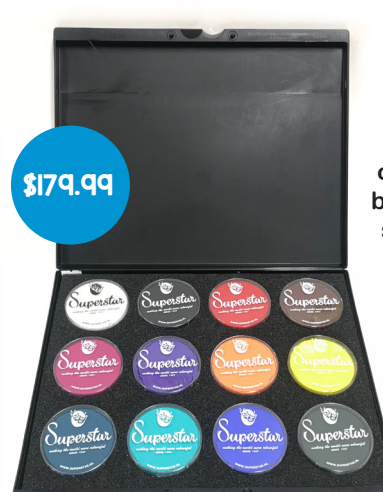
ESSENTIAL PALETTE SET